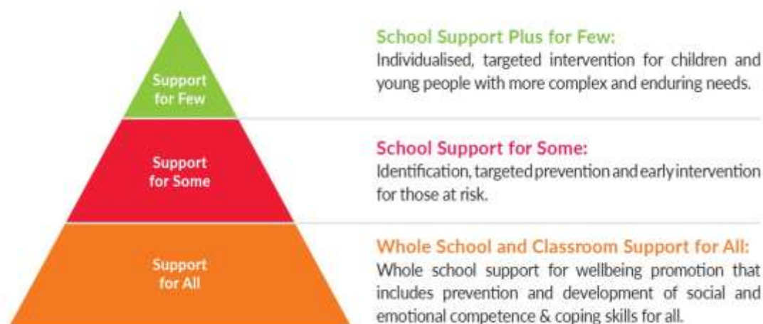
Figure 1: The DES Continuum of Support

while still others with more complex need will require an individualised approach to support.